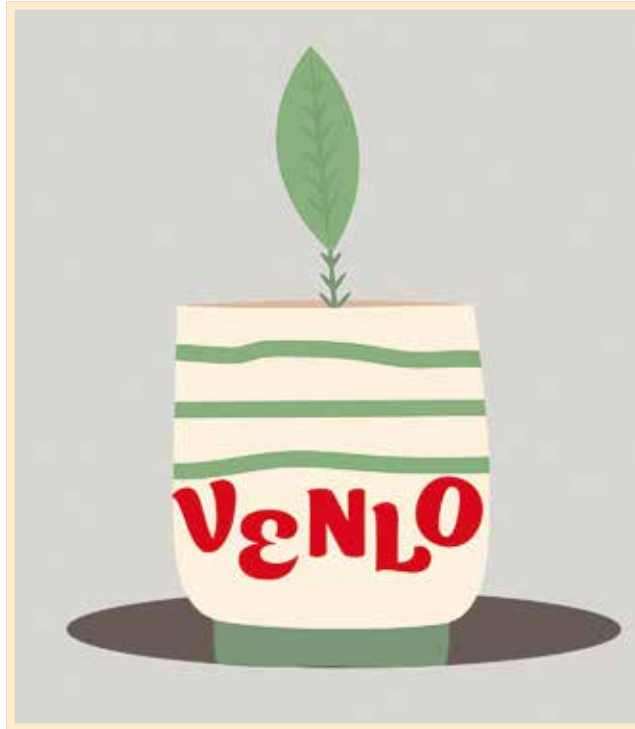
Illustration: Simone Golob

Cleij and Bulić are in no doubt about the value of the Brightlands campuses outside Maastricht (Sittard-Geleen, Heerlen, Venlo). “If we were to ignore the different regions in the province, things would look very different for UM, especially considering the recent political climate,” says Cleij. “It is part of FSE’s DNA to want to build, to experiment.” And yet, pioneering brings risks, too. They depend on external funding, such as the province or the municipalities. Not to mention, it takes time to build a presence (just look at the number of students in Venlo), and then there is the lack of structural university support. In Maastricht, there is one cleaning crew for all the university buildings, one Wi-Fi system, student psycholo-