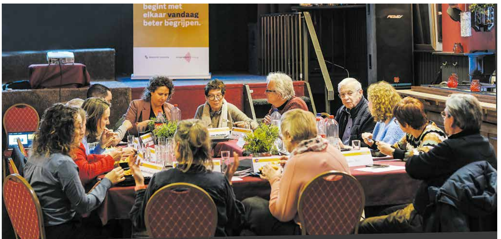
Researchers and locals coming together over chips in Heugem